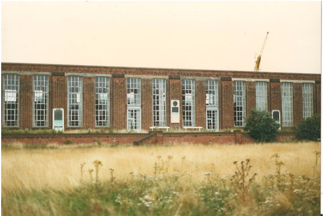
The works canteen, overlooking the (very overgrown!) bowling green – the three memorial plaques are shown in their position at the time of the closure of the Waterside Works.